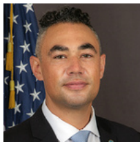
Sean Elo-Rivera Councilmember, District 9