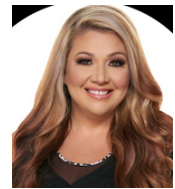
Randi Castle-Salgado Councilmember, District 2