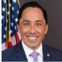
Todd Gloria Mayor